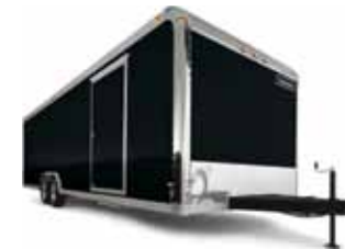
RACE & AUTO