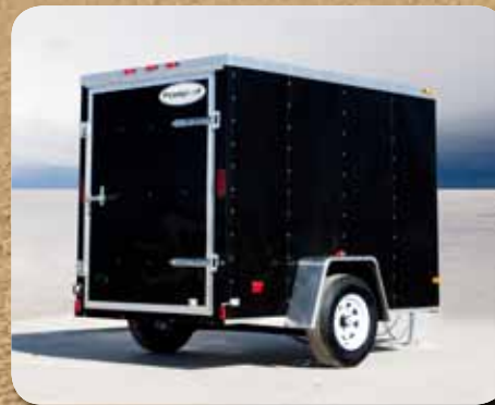
Single Rear Door — 4' & 5' wide models