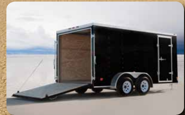
Rear Ramp Door available as optional equipment