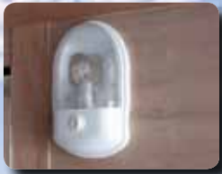
• 12V Dome Light

Sealed Double Bulb / DOT Approved Clearance Lights