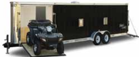
SNOWMOBILE & ATV